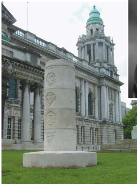
Eisenhower Monument, Belfast City Hall.

So just how deep are the historical connections between the two cities?