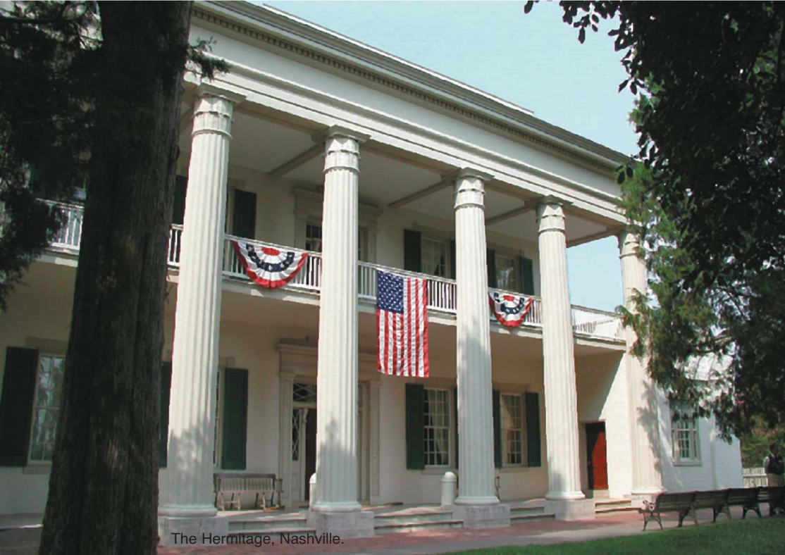
The Hermitage, Nashville.