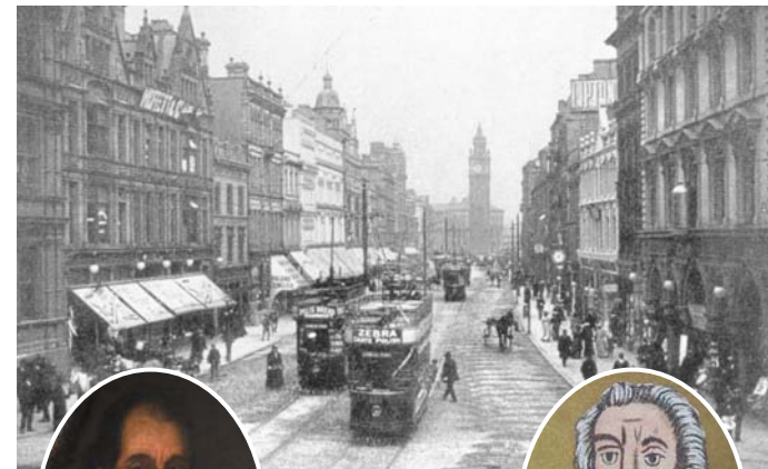
High Street Belfast.