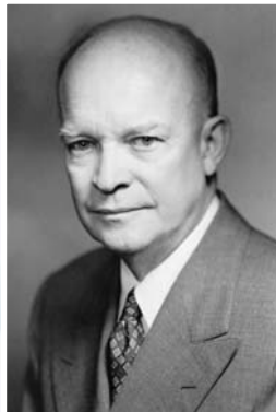
US President Dwight D Eisenhower