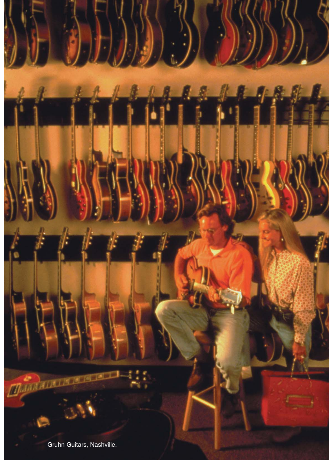
Gruhn Guitars, Nashville.