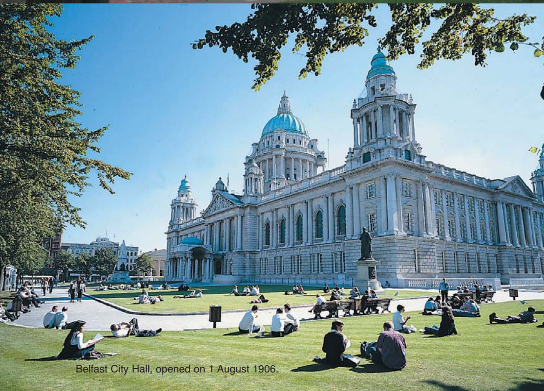
Belfast City Hall, opened on 1 August 1906.